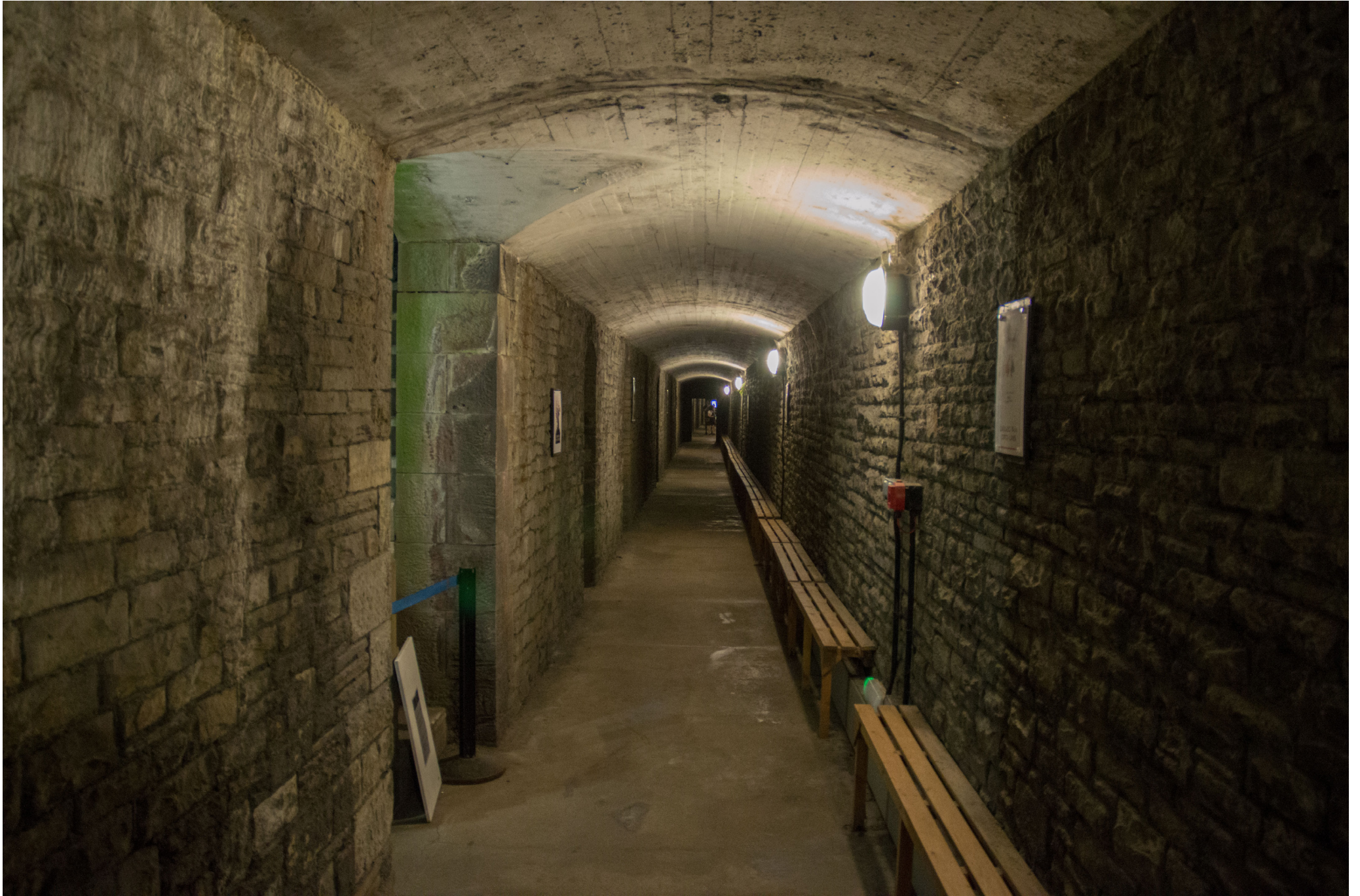
Air Raid shelter within the walls of Cardiff Castle