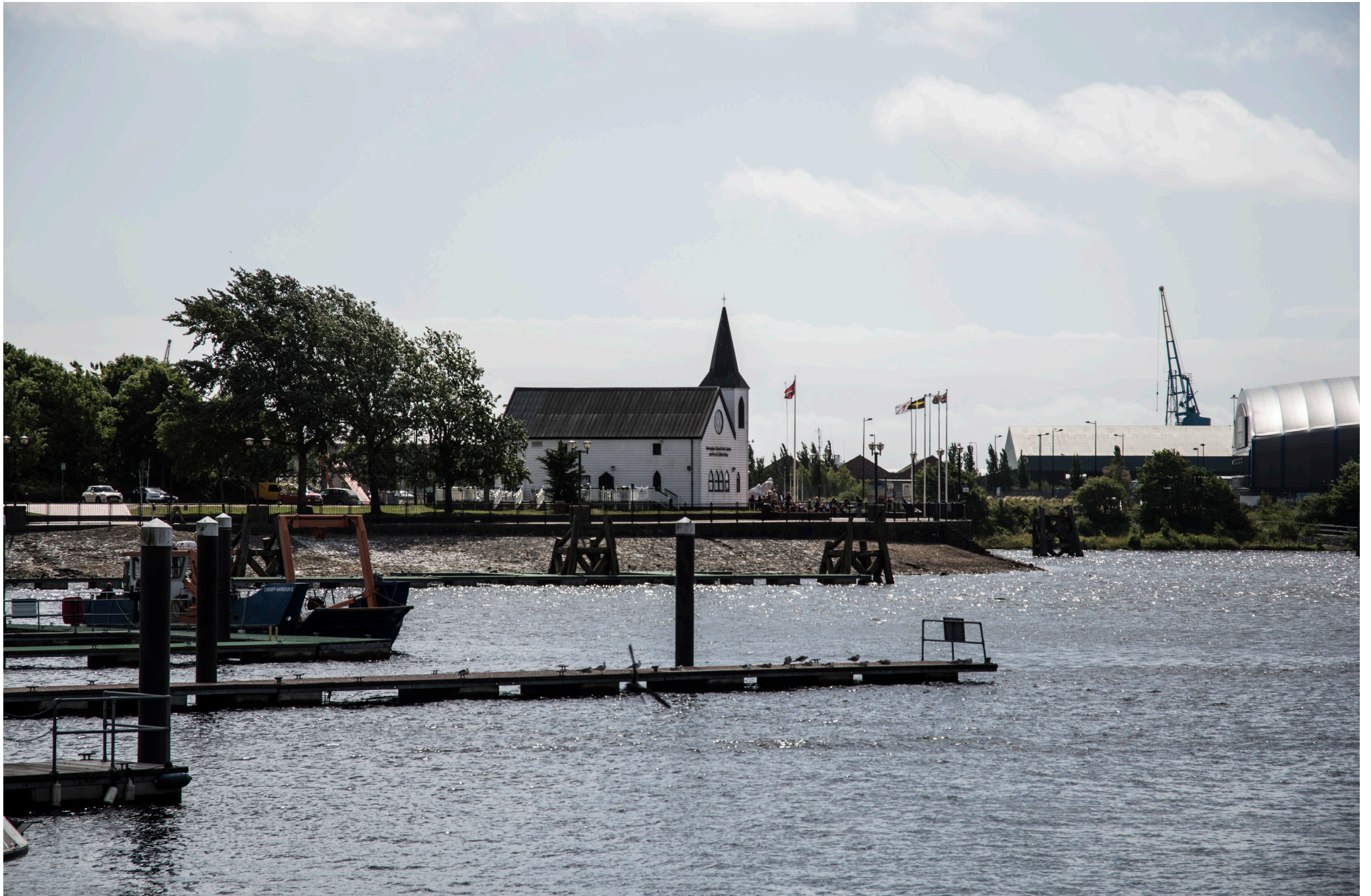
Norwegian Church, Cardiff Bay