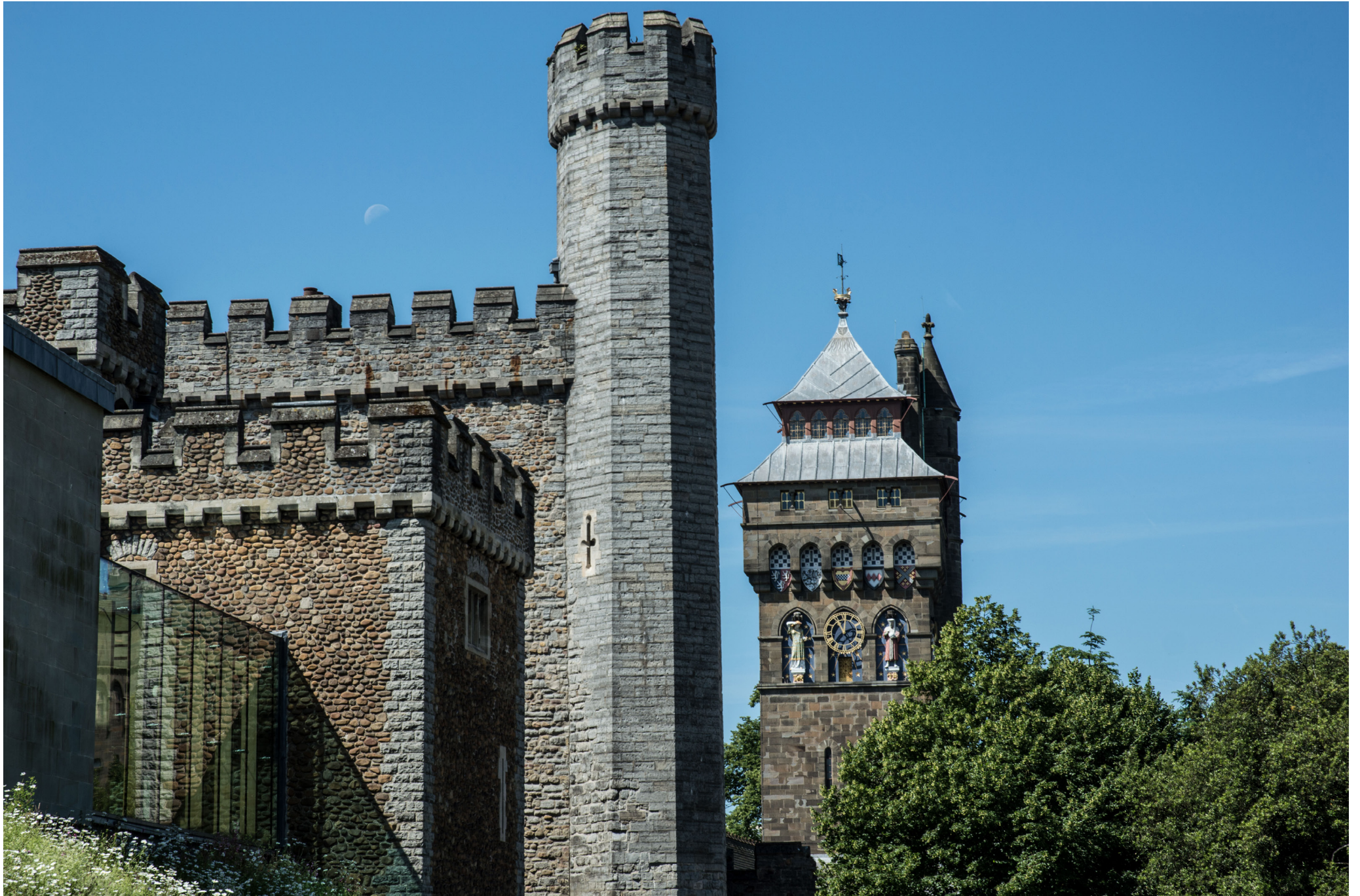
Mansion and Clock Tower