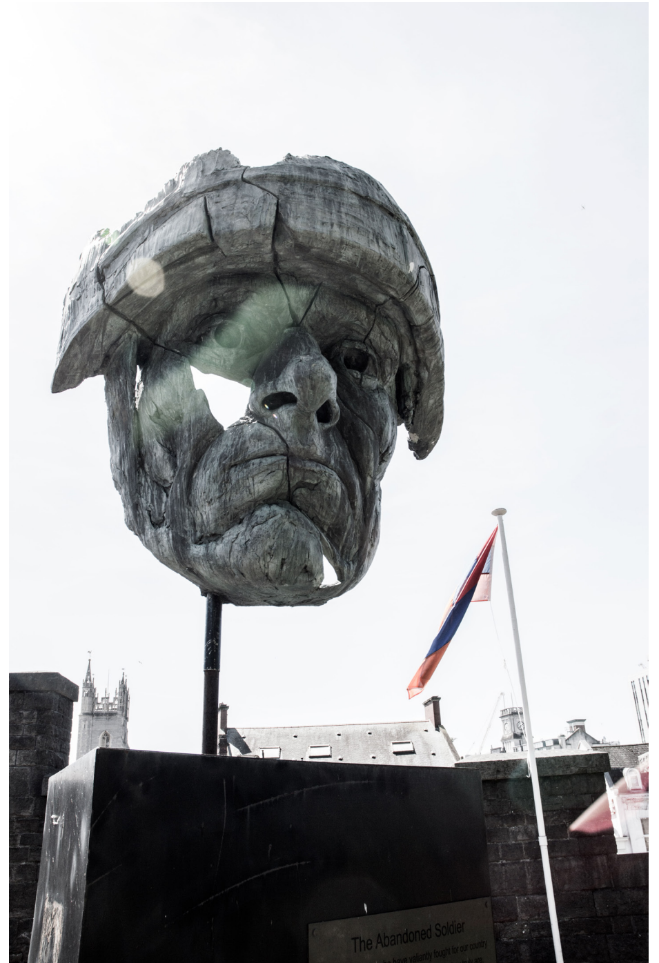
The Abandoned Soldier