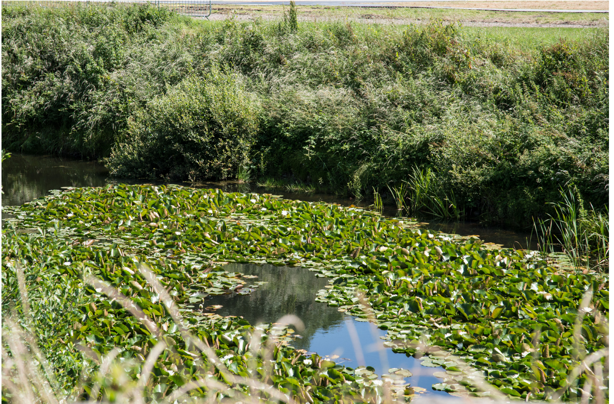
Water lilies in the moat surrounding the keep