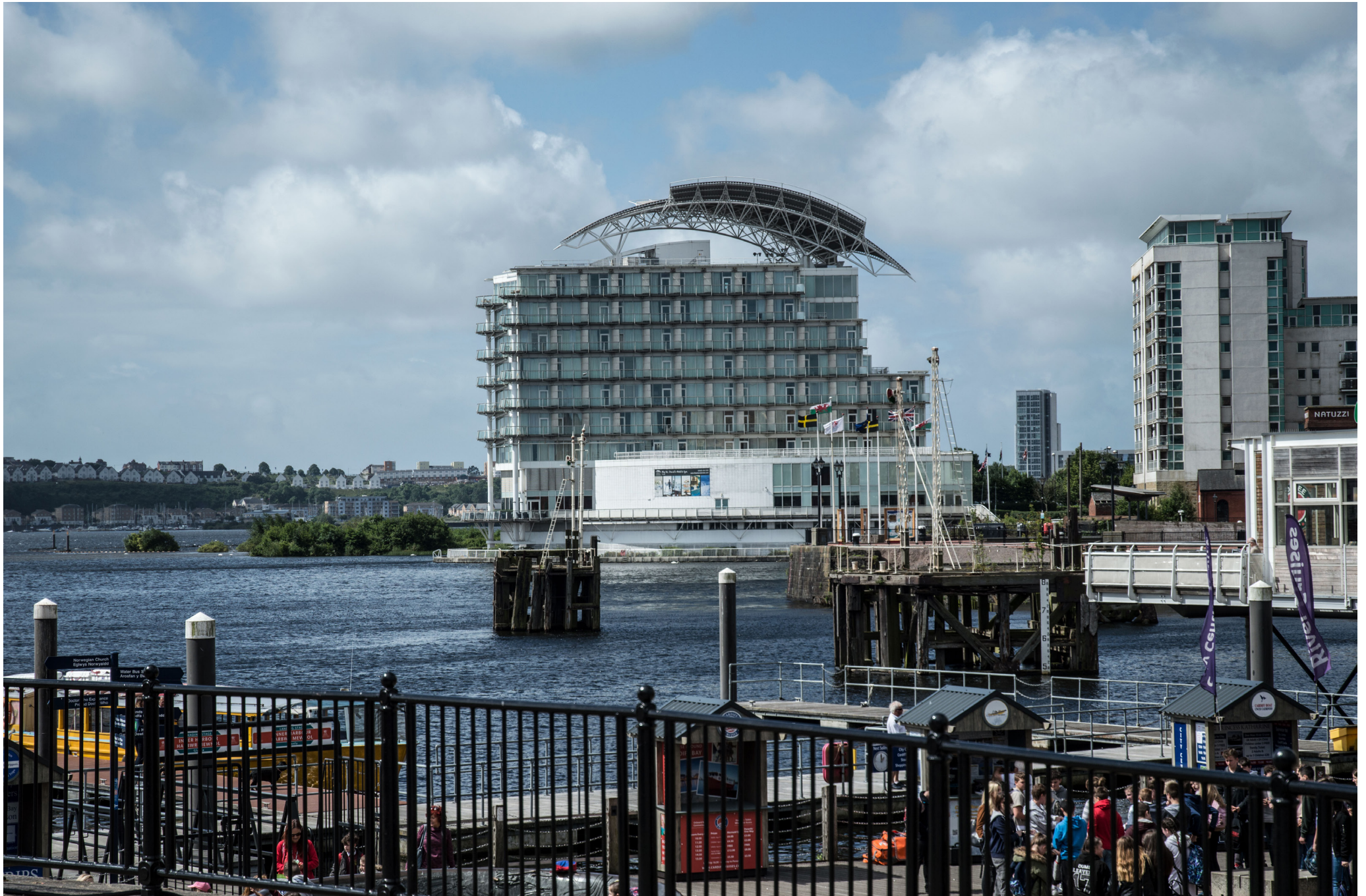
Cardiff Bay - Waterfront