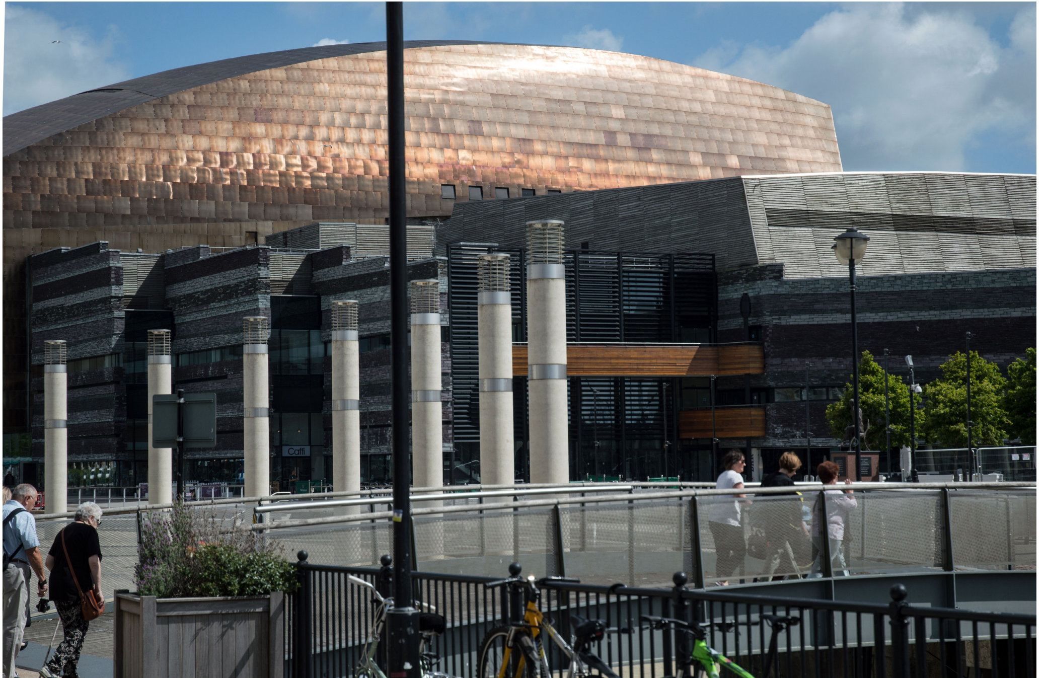
Cardiff Millennium Centre