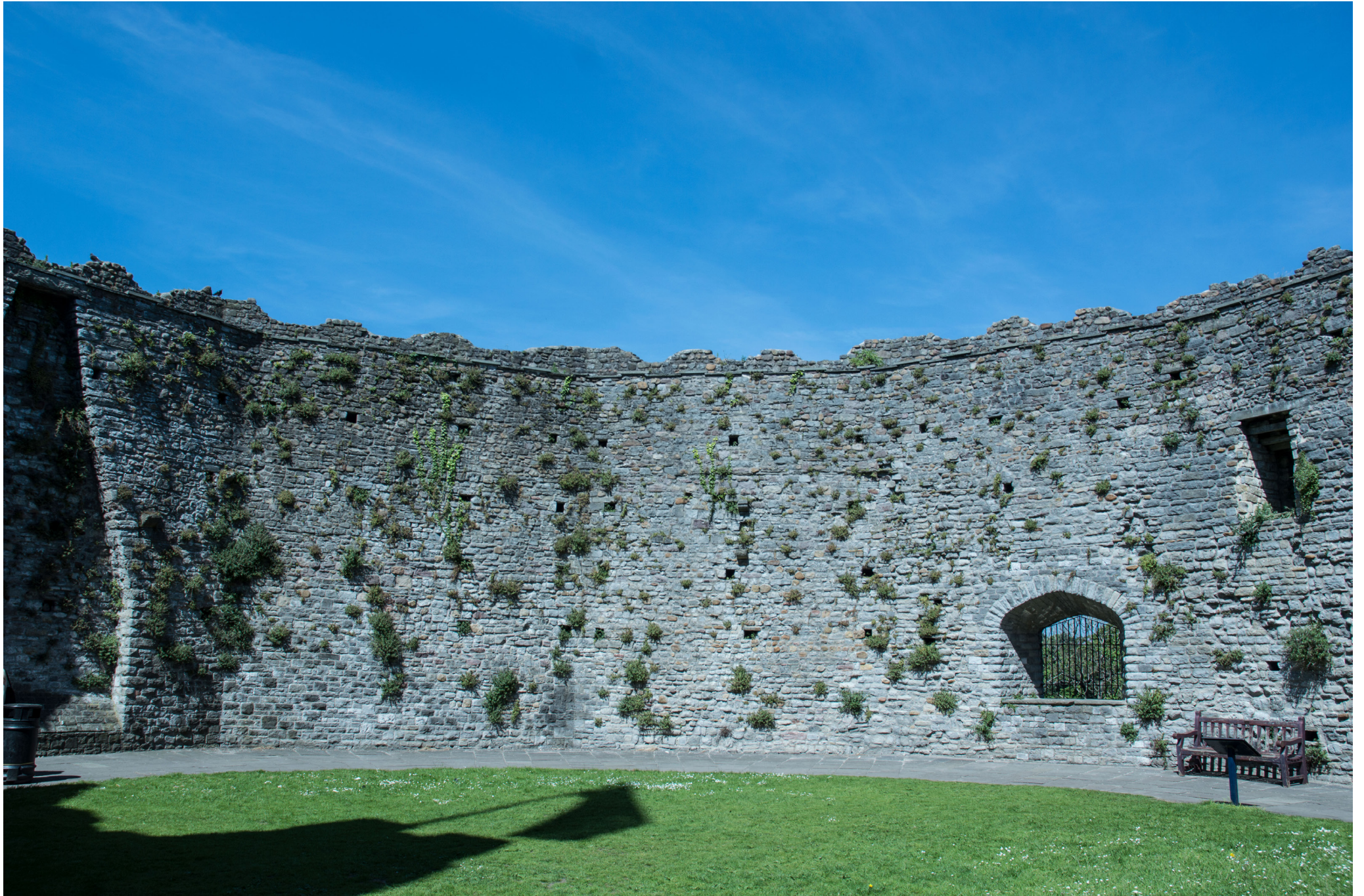
Inside the Keep