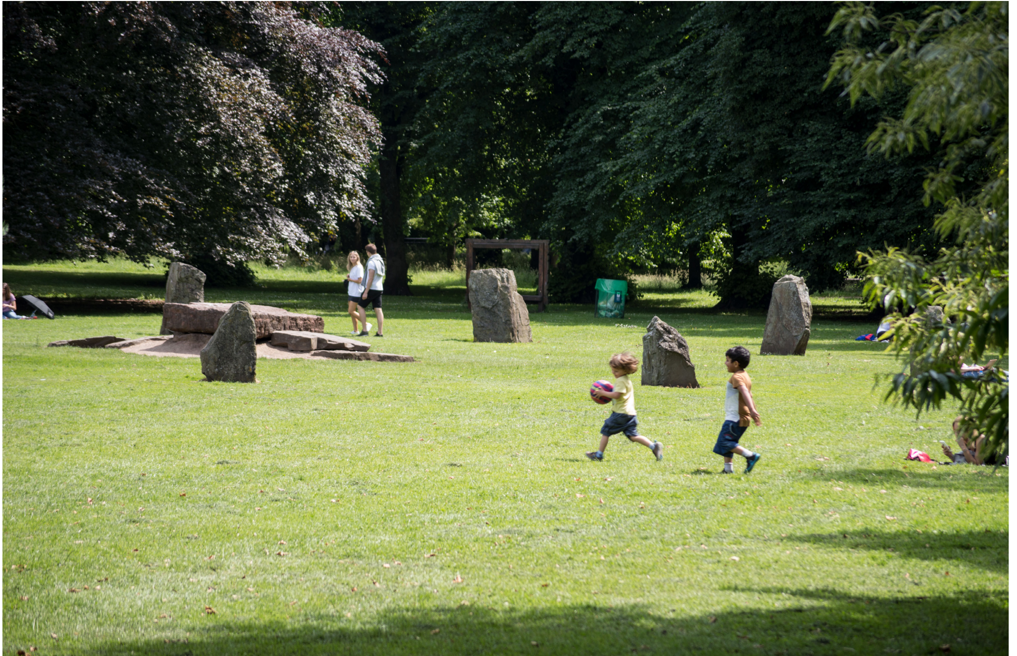
Bute Park & Arboretum