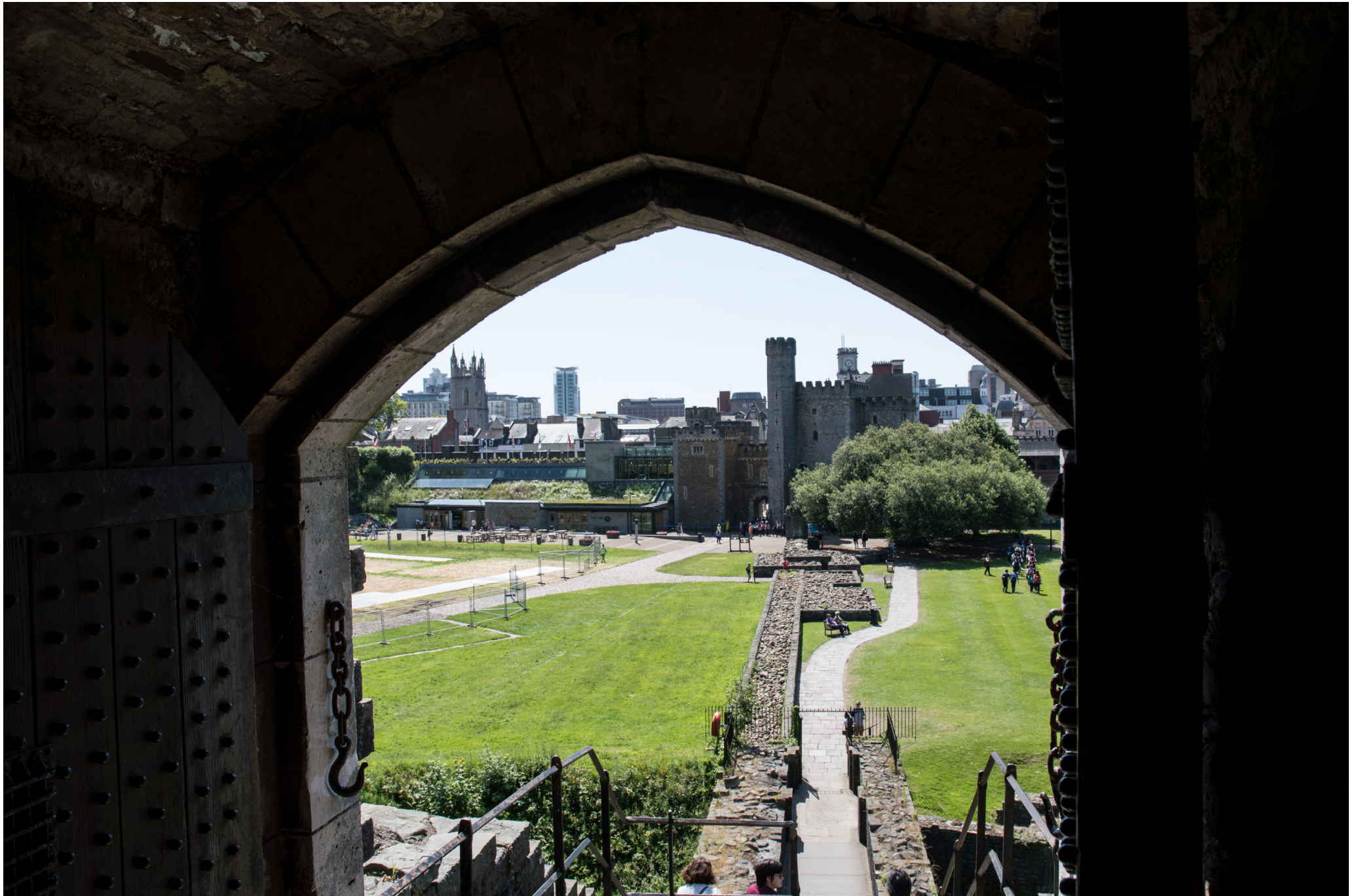
Showing the foundations of the inner wall of the castle