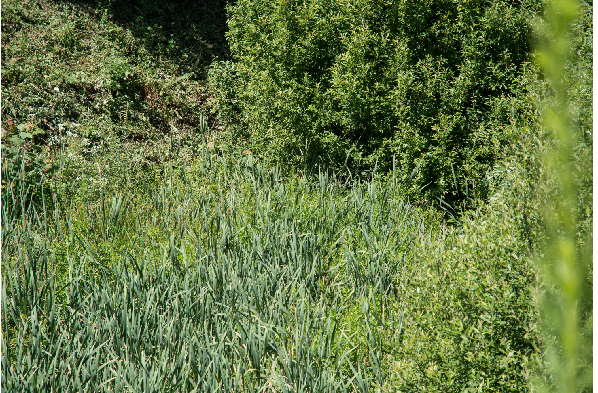
Rushes in the moat surrounding the keep