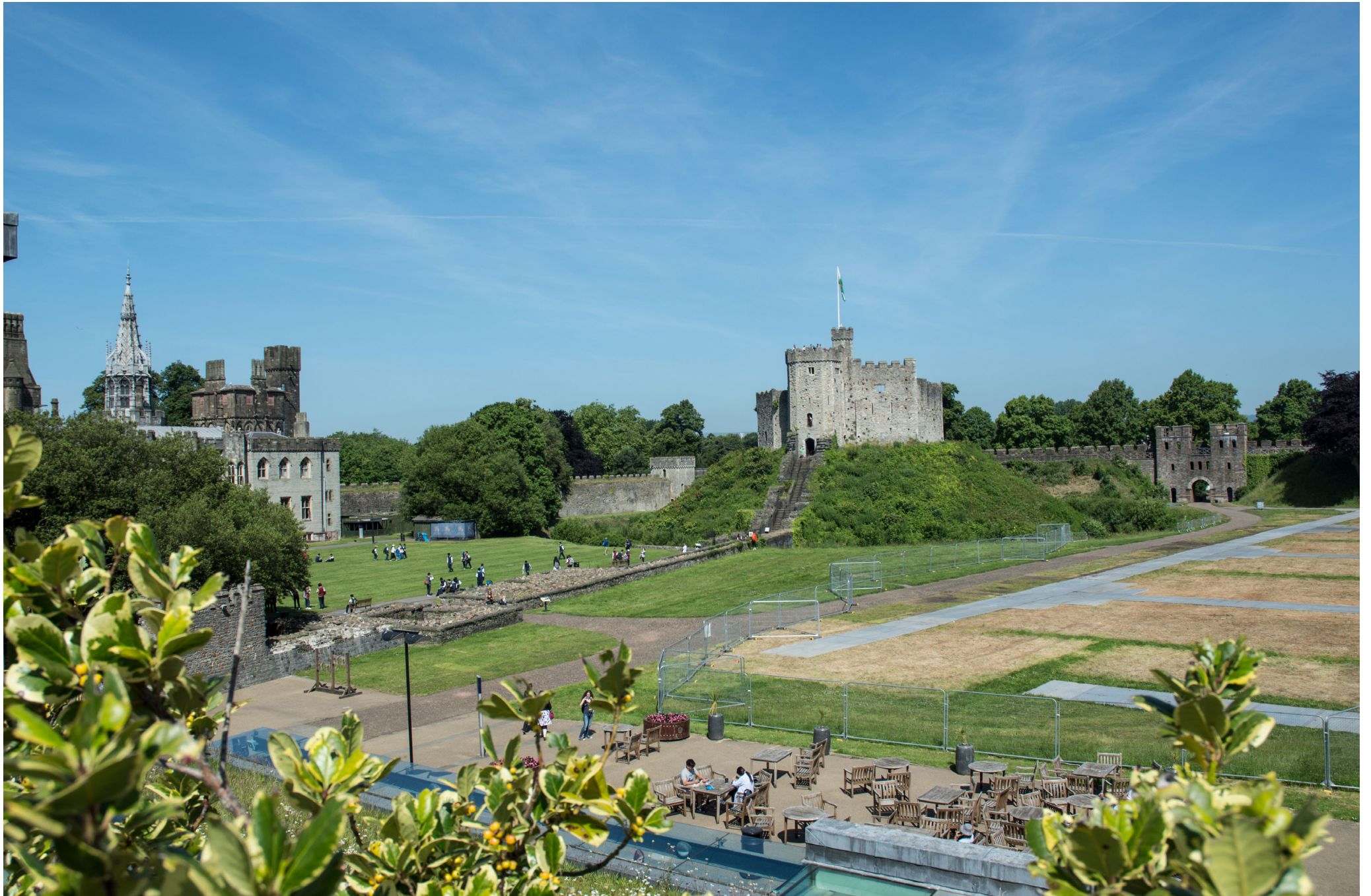
Cardiff Castle - Motte and Keep