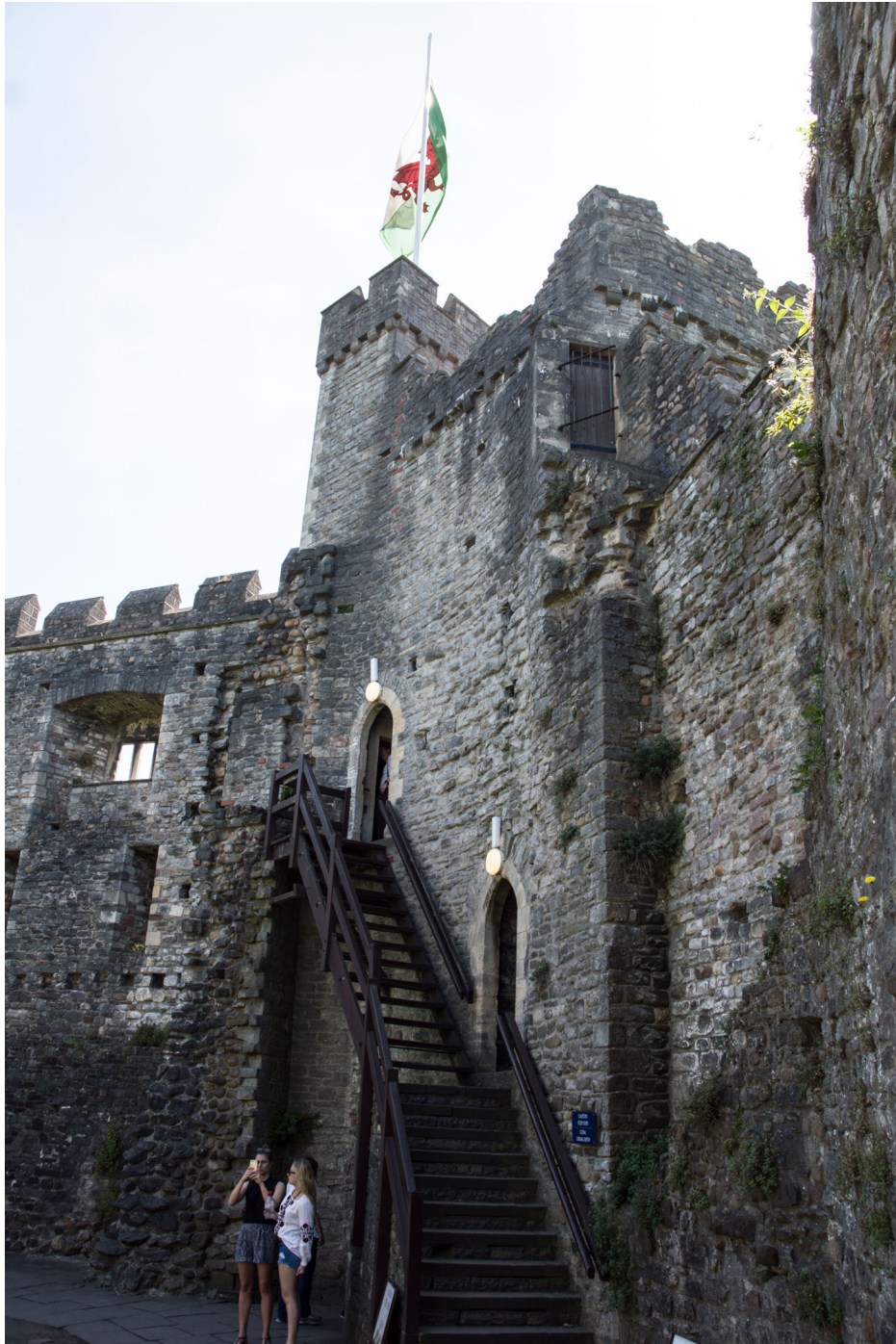
Steps to the tower